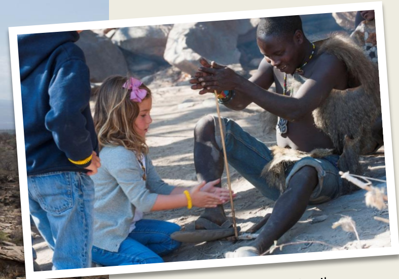
Travellers visiting a Hadzabe family