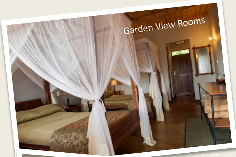
Garden View Rooms